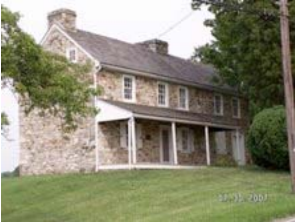
The Wisner Rapp House, Yellow Springs Road - Photo by Fred Alston

CHS is a non-profit organization charged with the task of protecting the documentation concerning historical properties and matters here in Charlestown Township.