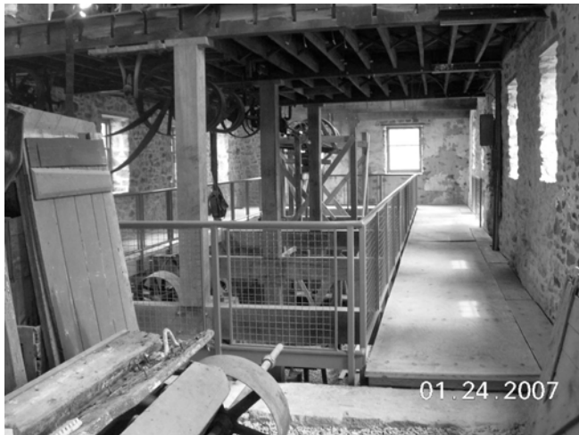
Above: Inside the Woolen Mill

The exterior road work, lighting and landscaping at our old woolen mill is now complete. The roadway was once Charlestown Road until PennDOT moved it to the other side of the mill. The structure was first built in 1729, three years before George Washington's birth. Over the centuries the ground has been filled in to better grade the highway so that the main floor is now the basement.