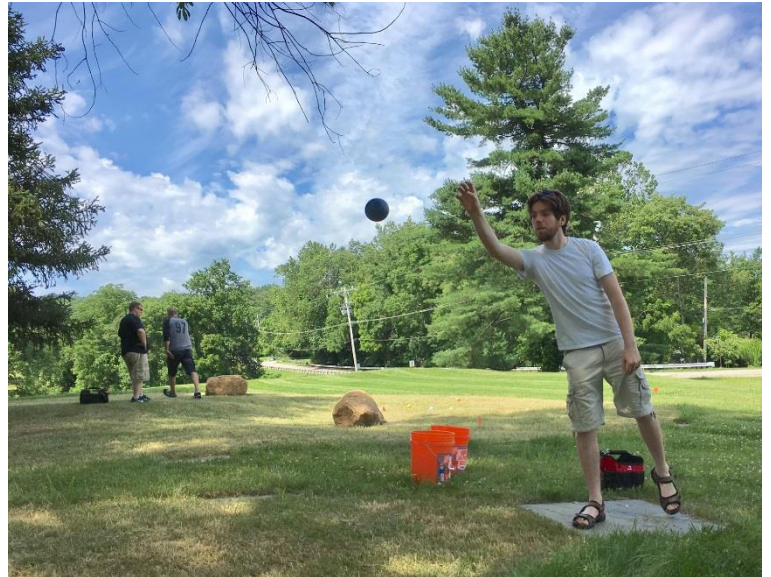
Above: Playing Stones at Charlestown Park

The improved lot will be interconnected to the Play and Pavilion Area with a series of new sidewalks.