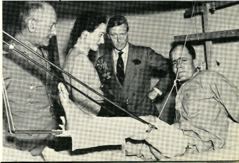
The Duke and Duchess of Windsor were just two of many famous visitors to the hospital.

The informational sign and commemorative area will help local residents and visitors to the park uncover more of the rich historical context and unique role that has graced Charlestown and the entire Phoenixville area.