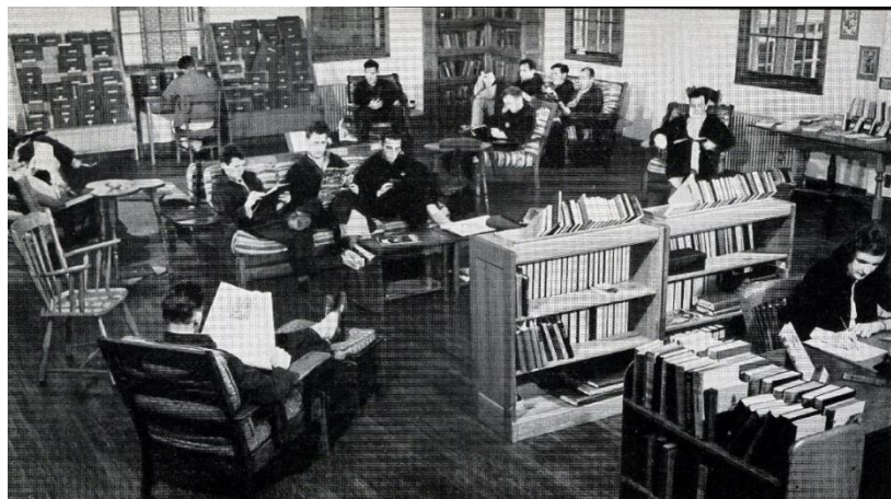
The Post Library

The sign will commemorate the formative role that the Valley Forge Military Hospital played in shaping the history of the nation and the Phoenixville area.