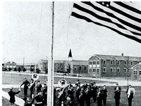
Flag Raising Ceremony

Valley Forge Military Hospital, which formerly operated on the campus now occupied by the University of Valley Forge, was once the largest military hospital in the entire country. From World War II through the Vietnam War, the hospital admitted thousands of patients and several hundred enemy prisoners of war, all while pioneering groundbreaking technology in plastic surgery and artificial eye replacements.