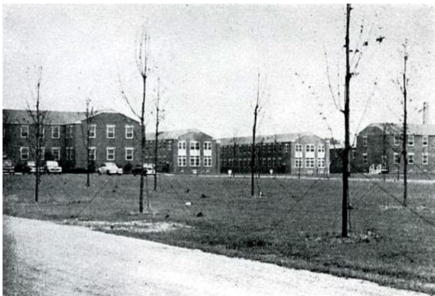
At right: The Hospital in 1947

Valley Forge Military Hospital, which formerly operated on the campus now occupied by the University of Valley Forge, was once the largest military hospital in the entire country. From World War II through the Vietnam War, the hospital admitted thousands of patients and several hundred enemy prisoners of war, all while pioneering groundbreaking technology in plastic surgery and artificial eye replacements.