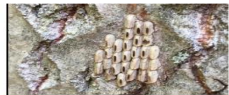
The empty remains of the eggs that have hatched can be found at any time of the year.