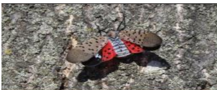
An adult showing the red underwings when disturbed