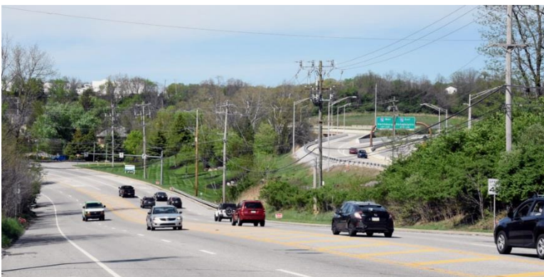
Route 29 – a sinkhole prone area

Route 29 (Morehall Road) will be reduced to ONE LANE IN EACH DIRECTION starting June 8 th and will continue all summer along Route 29 in East Whiteland Township.