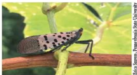
Profile of adult SLF on grape