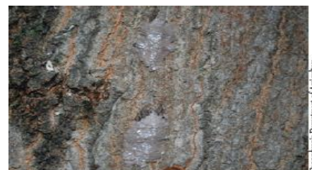
Egg masses of L. delicatula covered by waxy deposits