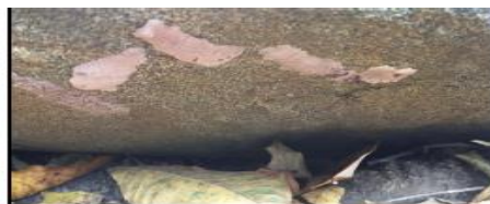
The egg masses can be on trees, rocks, or any other solid object and can be present from September through May.