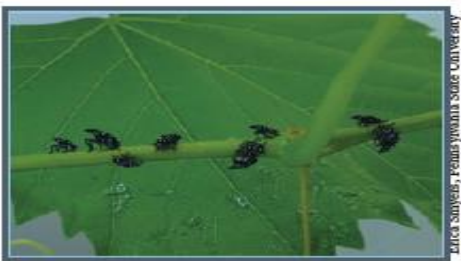
Early instar nymphs (1st through 3rd) feeding on grape