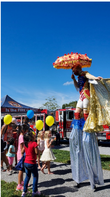
The Lady on Stilts was a source of fascination for adults & kids alike