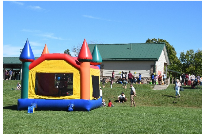
The Bounce House was a hit as always

Here are some pictures & captions from the day