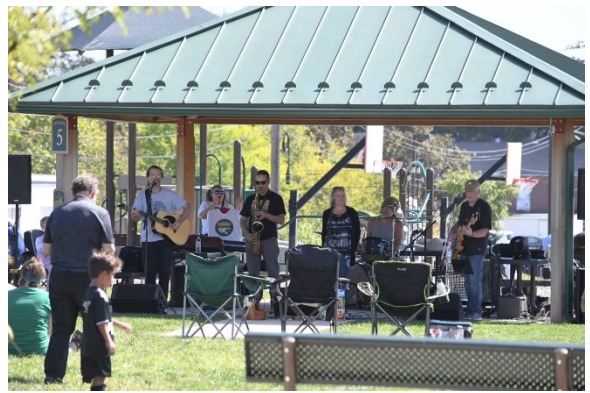
Music by the Mighty Manatees provided a festive air to the day's events