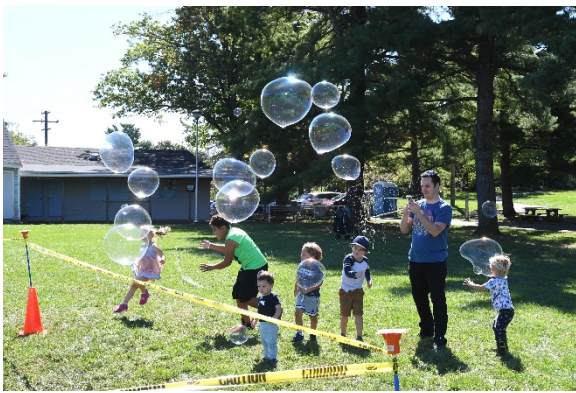
Giant bubbles from Bubbletopia made for good clean fun