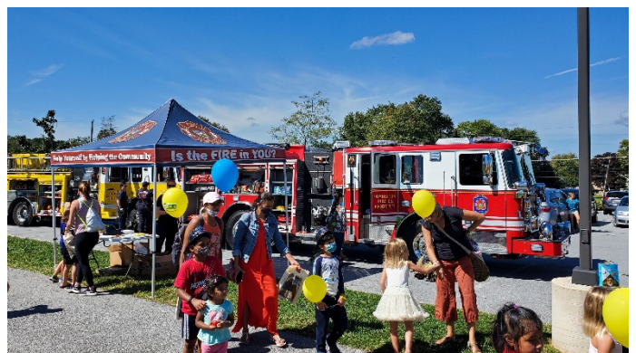
Both the East Whiteland & Kimberton Fire Companies took part