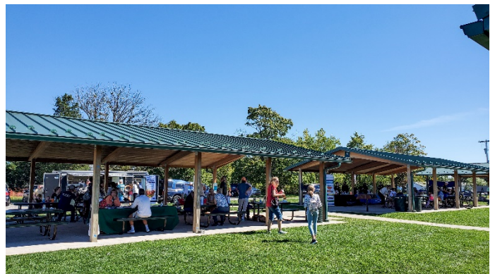
Visitors checked out the various booths set up in the Park Pavilions