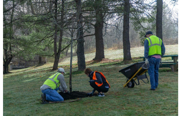
Tree planting at Charlestown Park

We continue to be pleased at the amount of participation we see each year.