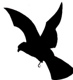
Hovering - fast wing beats