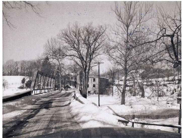
Historic Photo of Charlestown Road before the road was relocated to the east side of the Woolen Mill

If you are interested in the preservation and protection of the many historically significant structures located in Charlestown Township, please submit a letter of interest to Charlestown Township, P.O. Box 507, Devault, PA 19432 or email: manager@charlestown.pa.us